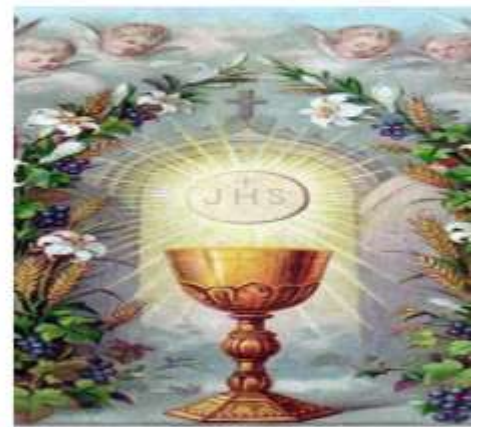
Corpus Christi June 19