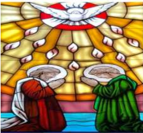
Pentecost June 5