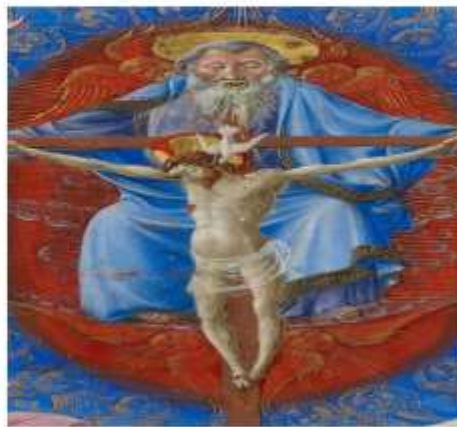
Holy Trinity June 12